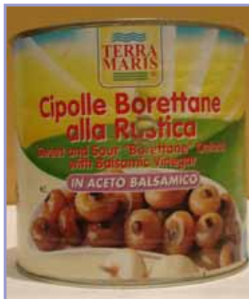
Giant Onions in Balsamic Vinegar 2kg > CBGU