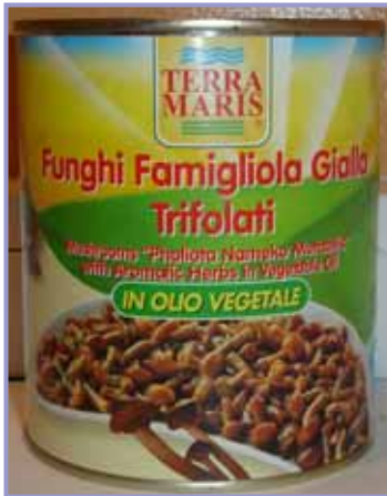
Chiodini Mushrooms w/ Herbs > FFGT