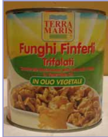
Chantelle Mushrooms In Oil and Herbs 2.5kg > FFT