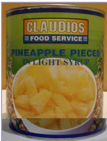
Pineapple Pieces 3.1kg > PIN