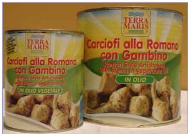
With Stems 1kg > ART1