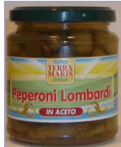
Lombardi Peppers in Vinegar 314gr > TMLP