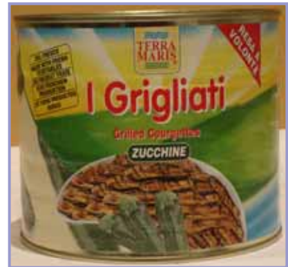
Zucchini > TMZG