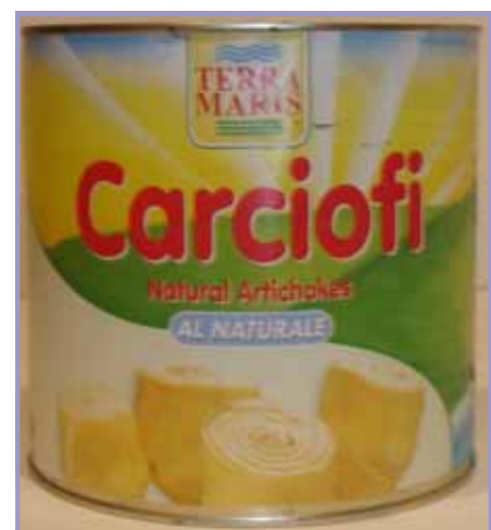
Artichoke Hearts in Brine 2.6kg > ART