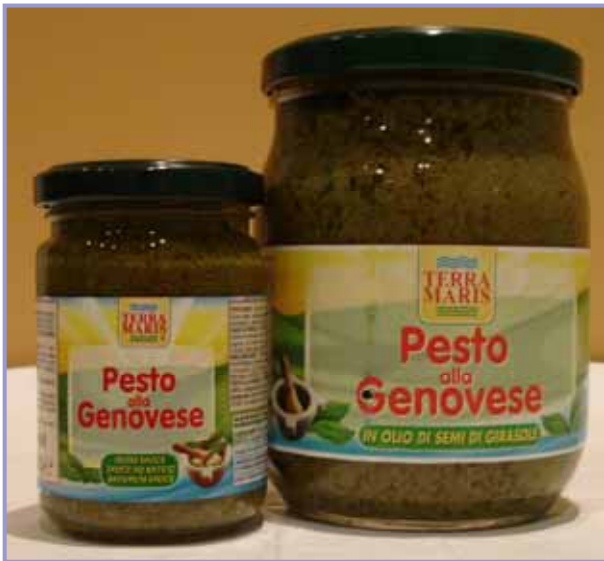
Pesto Genovese Style