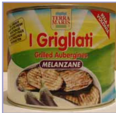
Eggplant > TMMG