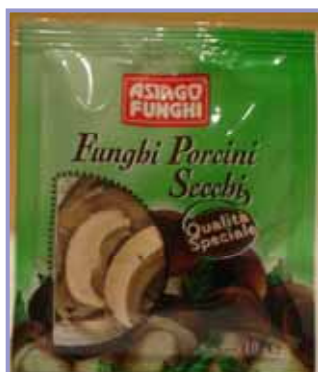
Porcini Mushrooms 10gr > FUPB