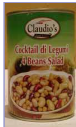
4 Bean Mix > FBM