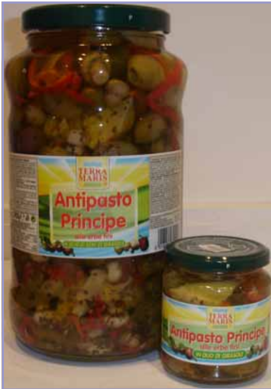
Mixed Antipasto in Oil and Herbs