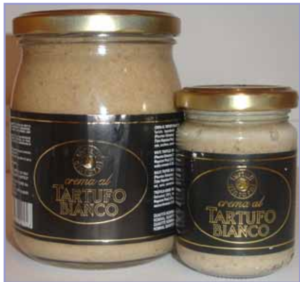
White Truffle Cream