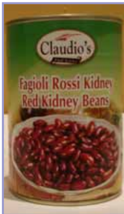
Red Kidney > RK