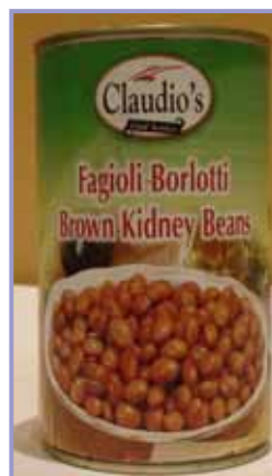
Borlotti Beans > BB Brown Kidney Beans