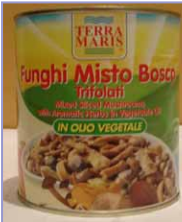
Sliced Mushrooms In Oil and Herbs 780gr > FMB