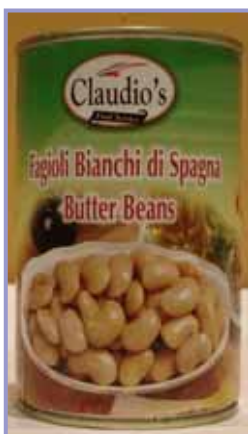
Bianchi Di Spagna > BDS Butter Beans