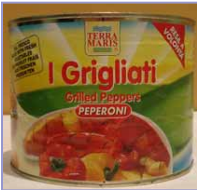
Capsicum > TMCG