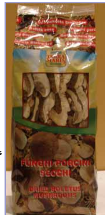
Porcini Mushrooms 450gr > FUP