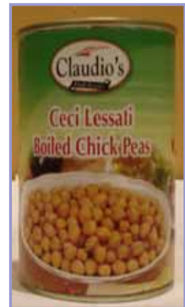
Chick Peas > CP