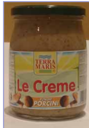
Porcini Mushroom Paste 500gr > CFP