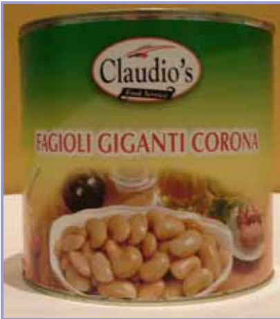
Large Butter Beans 3kg > GFC