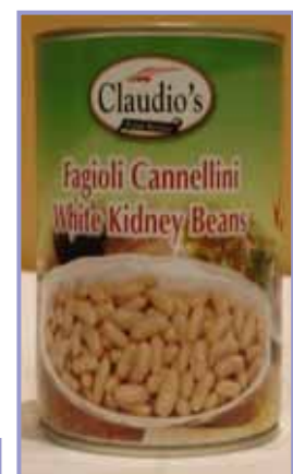
Cannellini Beans > CB White Kidney Beans