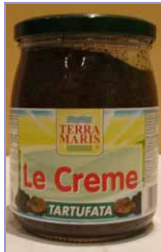
Black Truffle Paste 500gr > BTC