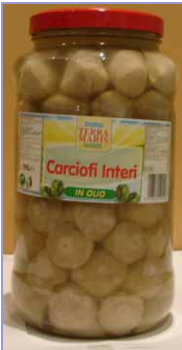
Artichoke Hearts in Oil 3kg > ART5