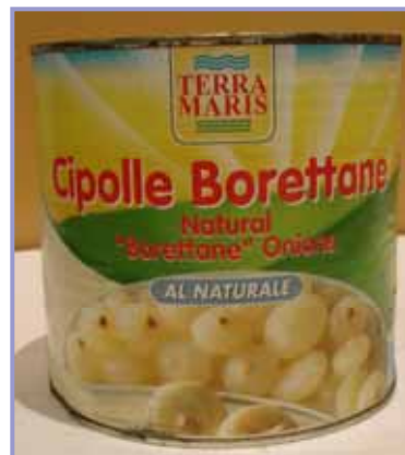
Onions in Brine