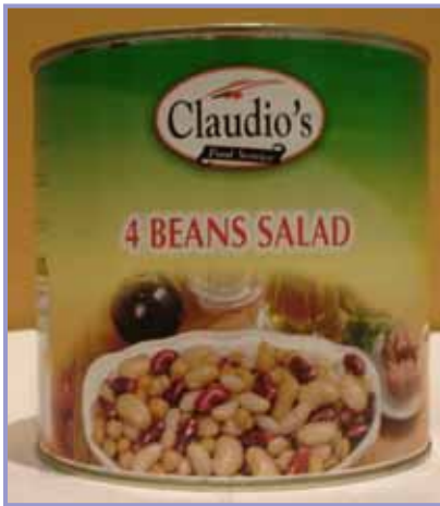
4 Bean Mix 3kg > FBM1