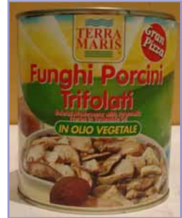
Sliced Porcini Mushrooms In Oil and Herbs 780gr > FPT