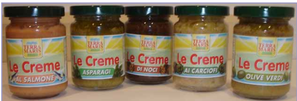
156ml Le Crème **NEW**