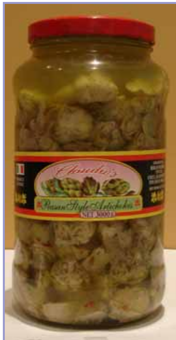
Halves in Oil and Herbs 3.1kg > ART2