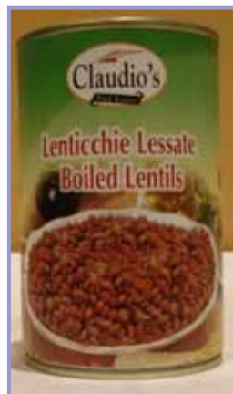
Lentils > LEN