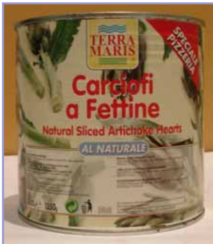
Slices In Brine 3kg > ARTS